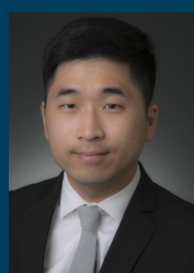
Chi Ho Jang Hospitality