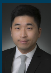
Chi Ho Jang Hospitality